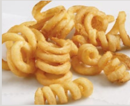
Tater Boy® Crispy QQQ's® (24328)

Also available: LW Private Reserve® (G0033)