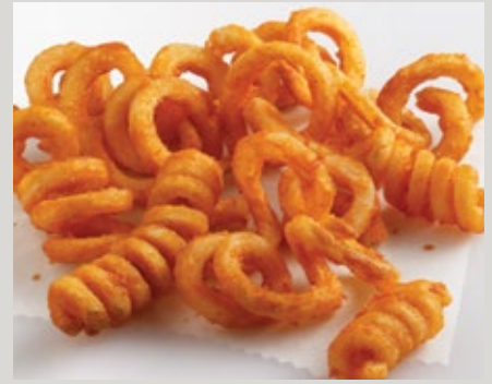
Lamb's Seasoned® Original Recipe Twister Fries® (D0073)

Also available: Curley QQQ's® (Q0004) Stealth® (S0010)