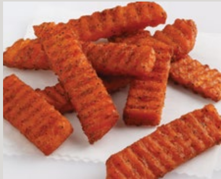
Sweet Things® Seasoned RibCut® Fries (L0097)

Also available: Sweet Things® Savory WaveLength Fries® (L0082)