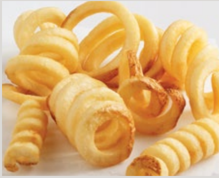
Twister Fries® (C0077) Skin-On

Also available: LW Private Reserve® (G0033)