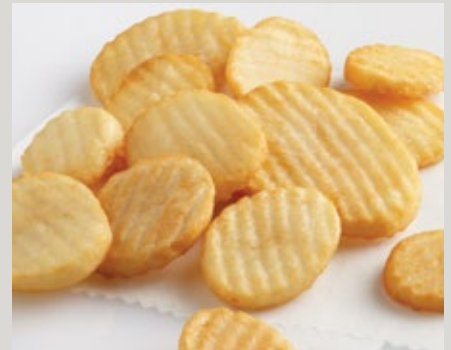
Rusettes® Cottage Fries (02124)

Also available: Generation 7 Fries® Bites (D20) Colossal Crinkle® (X15) Tater Boy® RibCut® (24253)