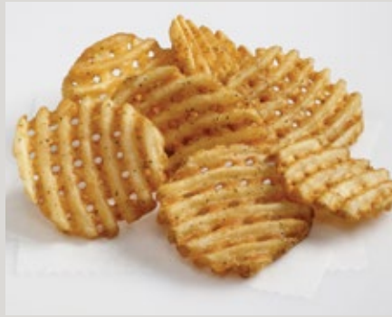
Lamb's Seasoned® Southern Style Recipe Mini CrissCut® Fries (K0120)

Also available: Stealth® Skin-On (S15) LW Private Reserve® (33L) Yukon Selects® (Y1005) Sweet Things® (L0090)