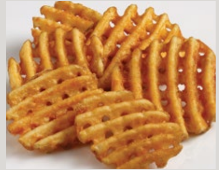
Lamb's Seasoned® Original Recipe CrissCut® Fries (D23)

Also available: Spicy Recipe (Y0066) Tempura Recipe (25D) aMAIZing Fries® (P26)