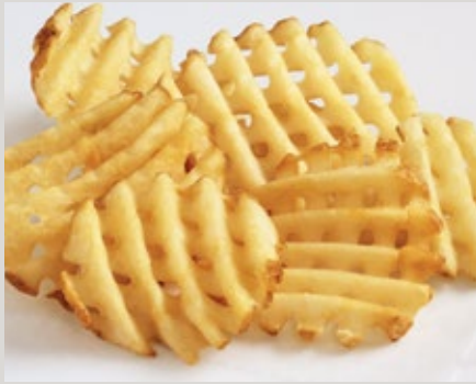
CrissCut® Fries (P55) Skin-On

Also available: Spicy Recipe (34Z) Western Spicy Crispy QQQ's® (24322)