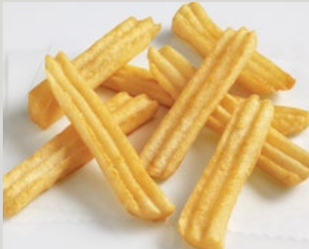
Lamb's Supreme® WaveLength Fries® (D07)

Also available: Spicy Recipe (Y0066) Tempura Recipe (25D) aMAIZing Fries® (P26)