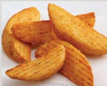
Lamb's Seasoned® Chicken Batter Recipe Crinkle Deli Wedge® (D17)

Also available: Generation 7 Fries® (X30)