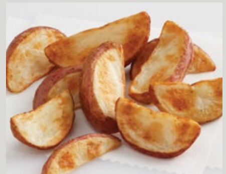
Alexia® Oven Roasted Red Skin Wedge Cut (AX584) Non-Seasoned (AX586)

Also available: Slim (D19) Bites (D20) Generation 7 Fries® Slim (X24)