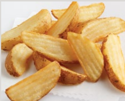
LW Private Reserve® Crinkle Wedge Cut (33D)

Also available: Generation 7 Fries® (X30)