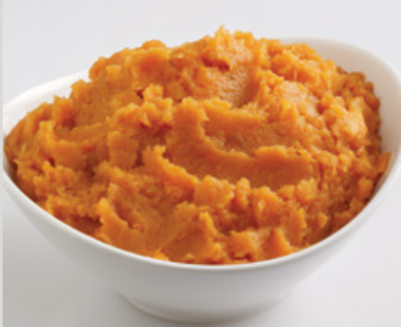
Sweet Things® Original (M0007)