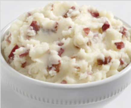
Lamb's Supreme® Red Skin (M22)