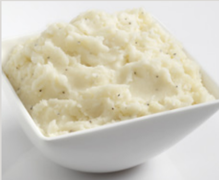
Lamb's Supreme® Homestyle (N88)

Also available: Lightly Seasoned (M14) Seasoned (M12) Low Fat Recipe (M15)