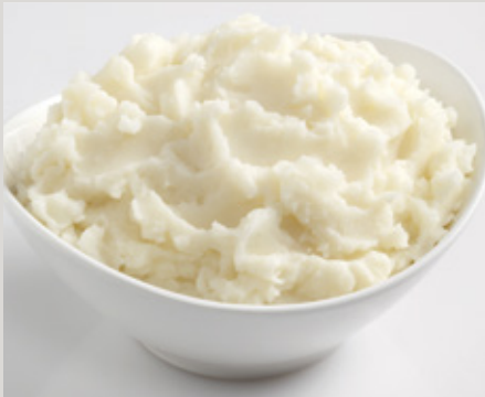
Lamb's Supreme® Roasted Garlic (M18)