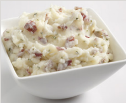
Lamb's Supreme® Bistro Style Red Skin (M24)