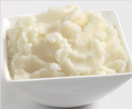
Lamb's Supreme® Original (M16)

Also available: Lightly Seasoned (M14) Seasoned (M12) Low Fat Recipe (M15)