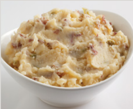
Lamb's Supreme® Jalapeño Cheddar Red Skin (M0013)