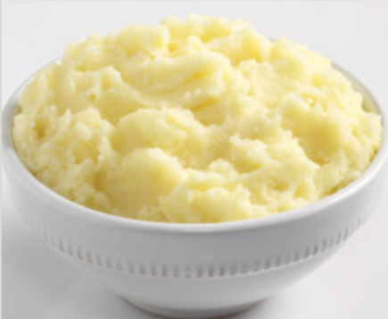
Lamb's Supreme® Gold (M0011)